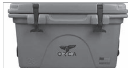
All Orca coolers and cups