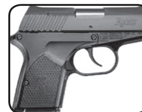
The Remington RM 380 Suggested Retail $439 Texas Ranch Outfitters Black Friday Weekend Sale $289.95 + $40 Factory Rebate = $249.95 Limited Quantity COMPACT. RELIABLE. TOTALLY