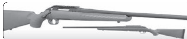
Ruger American Predator Rifle in 243 or 204 caliber Suggested Retail $529.95 Texas Ranch Outfitters Black Friday Weekend Sale PRICE $349.95 Limited Quantity Available

GET ALL YOUR HUNTING GEAR INCLUDING A FULL LINE OF BENELLI, BERETTA AND FRANCHI AT TEXAS RANCH OUTFITTERS