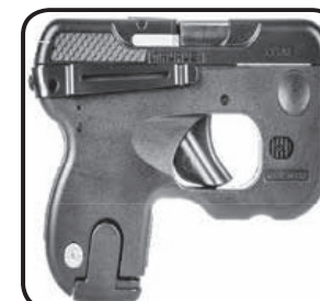
Taurus 380 Curve designed to fit the contour of your body. Retail $399.95 Texas Ranch Outfitters Black Friday Weekend Sale PRICE $229.95 Limited Quantity Available

1420 FM 1483 Yantis, TX. 75497 903-383-2800