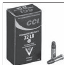
TEXAS RANCH OUTFITTERS BLACK FRIDAY WEEKEND SPECIAL CCI STANDARD VELOCITY 22 LONG RIFLE $3.99 LIMIT 2 PER CUSTOMER